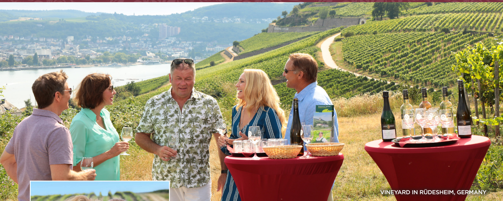
VINEYARD IN RÜDESHEIM, GERMANY

Uncork local traditions, savor intense flavors and enjoy palate-pleasing adventures during an AmaWaterways Wine Cruise