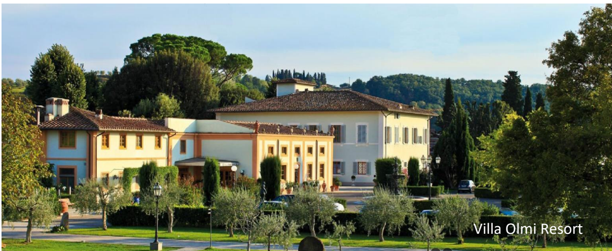
Villa Olmi Resort