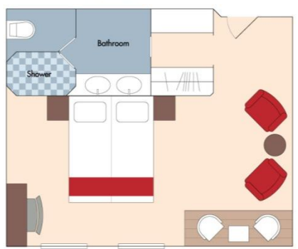
Floor-to-Ceiling Windows Outside Balcony

Your Rate: $7,398 pp includes exclusive wine package