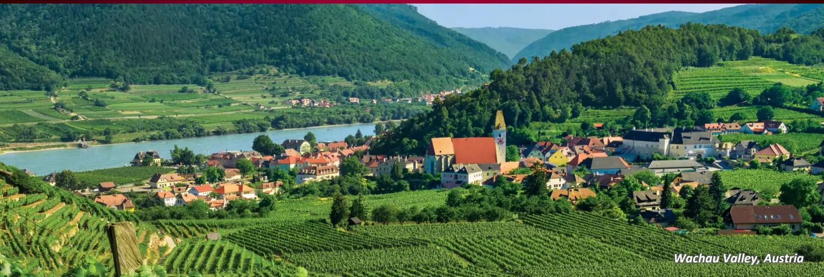
Wachau Valley, Austria

to Benefit the Sonoma County Farmworker Community