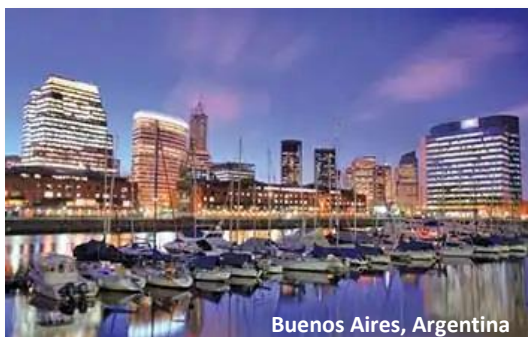
Buenos Aires, Argentina

"After many trips to Latin America, I want to share the wines, food and culture of this wonderful part of the world with you. The wines of these countries are among the best in the world, and I look forward to showing you how great they can be on this cruise."