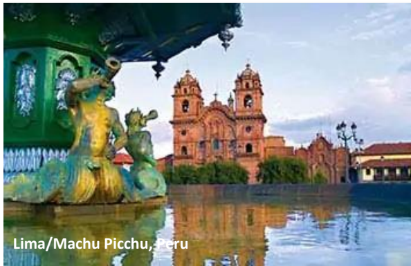
Lima/Machu Picchu, Peru