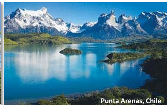
Punta Arenas, Chile

WineClub@CruiseShipCenters.com or 877-651-7447