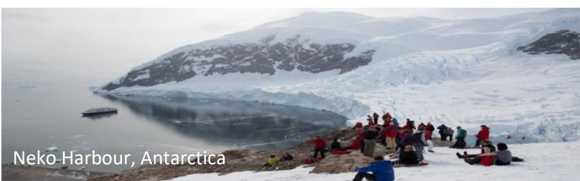
Neko Harbour, Antarctica