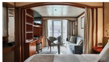
Classic Veranda Suite

"Join me for an unforgettable experience! Let's explore the bottom of the World; walk with the penguins, see majestic glaciers and enjoy returning to the comforts of Silver Cloud".