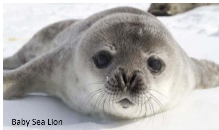
Baby Sea Lion