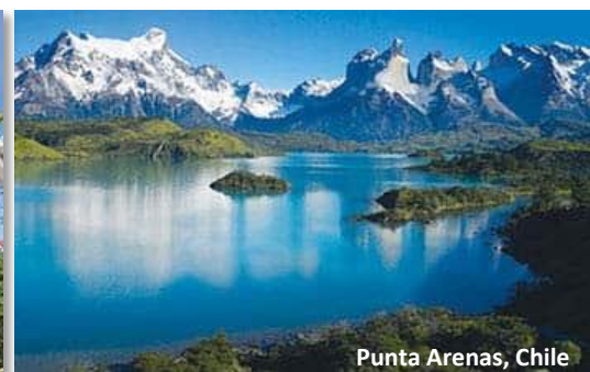
Punta Arenas, Chile

WineClub@CruiseShipCenters.com or 877-651-7447