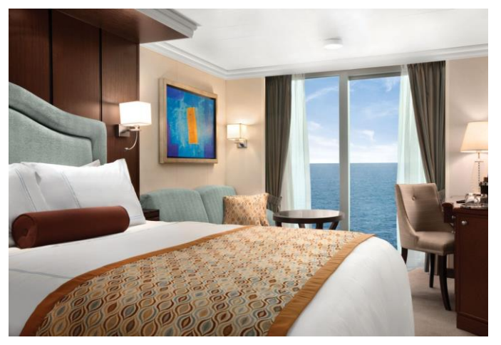
Deluxe Ocean View from $15,198 $4,898 Square footage: Approx. 242 sq ft Category C

Amenities: Floor-to-ceiling panoramic windows, spacious seating area, queen-sized bed convertible to two twins; over-sized marble and granite bathroom with tub and separate shower, LCD flat-screen television, vanity desk, breakfast table, hair dryer, safe, thick cotton robes and slippers, refrigerated mini-bar, direct dial satellite phone and cellular service