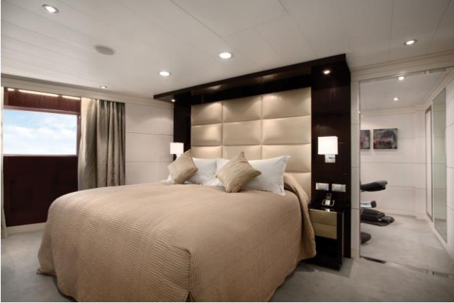
Vista Suite $30,998 $12,798 Square footage: 1,200 to 1,500 sq ft (including balcony)

Amenities: Private wrap-around balcony with Jacuzzi; large sitting area, dining area, separate bedroom with a king-size bed; walk-in closet; master bathroom with Jacuzzi bathtub and second bathroom with shower, two LCD flat-screen televisions, Bose® sound system, laptop computer with wireless access, CD/DVD player with an extensive media library, private fitness room, welcome bottle of champagne, refrigerated mini-bar replenished daily, thick cotton robes and slippers, cashmere lap blanket, hair dryer, safe, direct dial satellite phone and cellular service