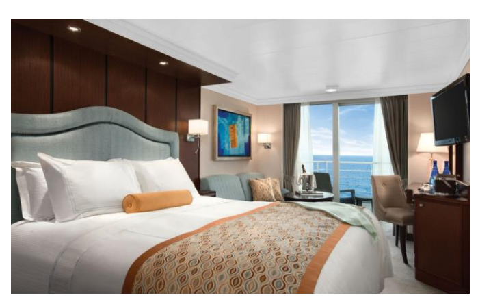
Concierge Level Veranda from $27,998 $5,848 Square footage: Approx. 282 sq ft (including balcony) Category A4 to A1

Amenities: Floor-to-ceiling panoramic windows, spacious seating area, queen-sized bed convertible to two twins; over-sized marble and granite bathroom with tub and separate shower, LCD flat-screen television, vanity desk, breakfast table, hair dryer, safe, thick cotton robes and slippers, refrigerated mini-bar, direct dial satellite phone and cellular service