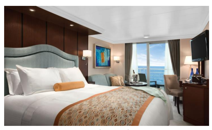
Veranda Stateroom from $16,198 $5,398 Square footage: Approx. 282 sq ft (including balcony) Category B4 to B1

Amenities: Queen-sized bed convertible to two twins; over-sized marble and granite bathroom with shower, LCD flat-screen television, vanity desk, breakfast table, hair dryer, safe, thick cotton robes and slippers, refrigerated mini-bar, direct dial satellite phone and cellular service