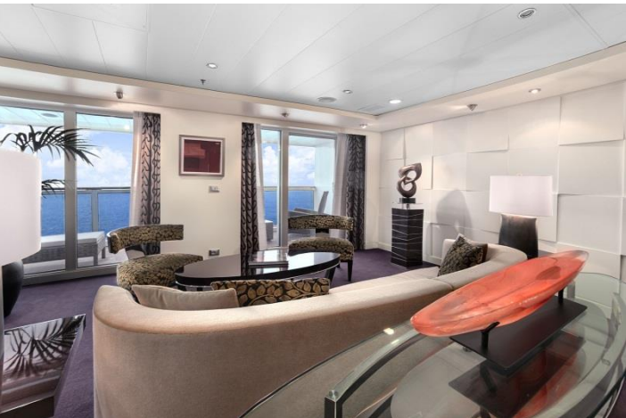
Oceania Suite $27,498 $11,048 Square footage: Approx. 1,000 sq ft (including balcony)

Amenities: Expansive private balcony with Jacuzzi; living room, dining room, separate bedroom with a king-size bed; walk-in closet; master bathroom with Jacuzzi bathtub and second bathroom with shower, 50 inch LCD flat-screen television, laptop computer with wireless access, CD/DVD player with an extensive media library, welcome bottle of champagne, refrigerated mini-bar replenished daily, thick cotton robes and slippers, cashmere lap blanket, hair dryer, safe, direct dial satellite phone and cellular service