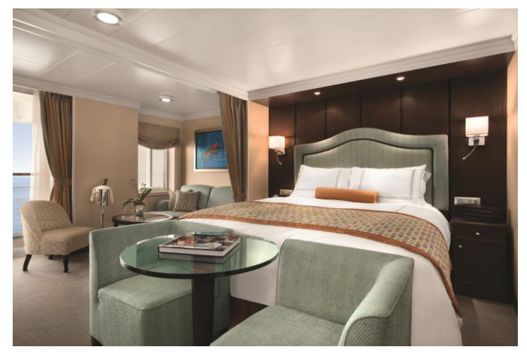
Penthouse Suite from $20,298 $7,448 Square footage: Approx. 420 sq ft (including balcony) Category PH3 to PH1

Amenities: Private balcony, living area, dining area, queen-sized bed convertible to two twins; walk-in closet; large marble and granite-clad bathroom with full-size bathtub and separate shower, LCD flat-screen television, laptop computer with wireless access, welcome bottle of champagne, refrigerated mini-bar replenished daily, lighted vanity, thick cotton robes and slippers, cashmere lap blanket, hair dryer, safe, direct dial satellite phone and cellular service