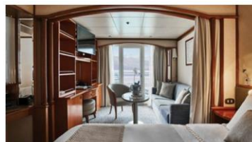
Classic Veranda Suite