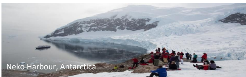
Neko Harbour, Antarctica