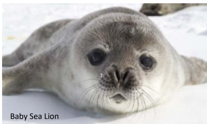
Baby Sea Lion