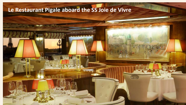
Le Restaurant Pigale aboard the SS Joie de Vivre