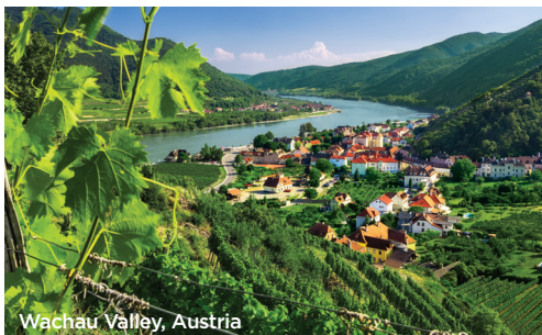
Wachau Valley, Austria

CST# 2101270-40 Fla. Seller of Travel Ref. No. ST42527