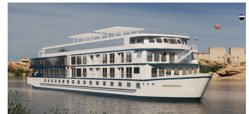
AmaDahlia Exterior Artist Rendering