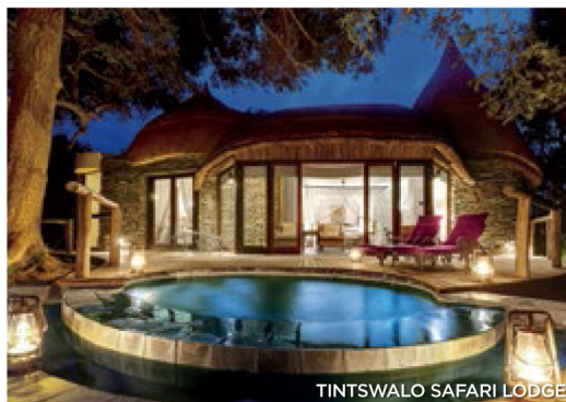
TINTSWALO SAFARI LODGE