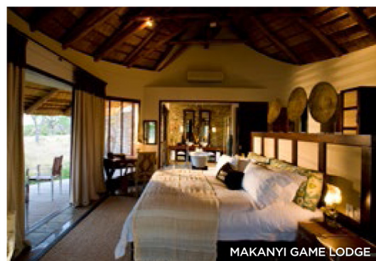
MAKANYI GAME LODGE

Terms & Conditions: All rates are per person in USD, based on double occupancy in stateroom Category SB and include $300 per person early booking discount. Unless explicitly stated that single supplement is waived, solo travelers in a double occupancy stateroom must pay single supplement before receiving any discounts. Discount is valid until November 30, 2020, and is not combinable with other promotions, limited to availability, capacity controlled and subject to change without notice. Other restrictions apply. Extra land programs, roundtrip airfare and gratuities are additional. AmaWaterways and Expedia Cruises, North Bay reserve the right to revise any errors on the flyer; itinerary subject to change. Registration as a seller of travel does not constitute approval by the State of California. For full terms and conditions contact Expedia Cruises, North Bay. CST#2101270-40; Fla. Seller of Travel Ref. No. ST42527.