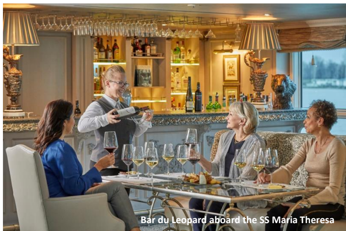
Bar du Leopard aboard the SS Maria Theresa