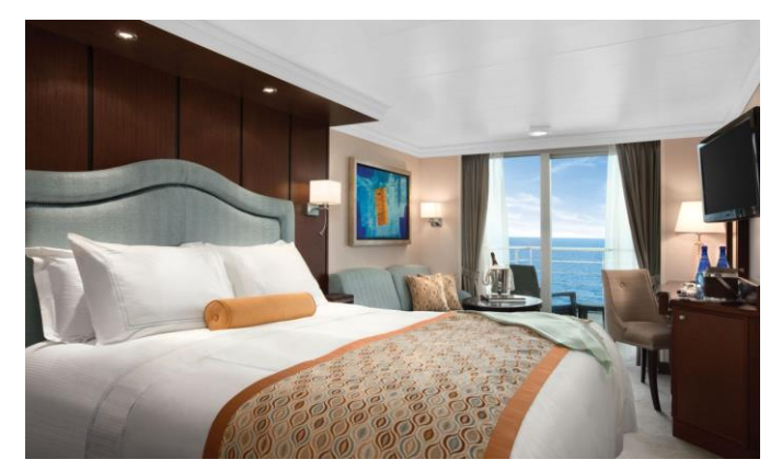
Concierge Level Veranda from $4,498 Square footage: Approx. 282 sq ft (including balcony) Category A4 to A1

Amenities: Private balcony, plush seating area, queen-sized bed convertible to two twins; oversized marble and granite bathroom with tub and separate shower, LCD flat-screen television, laptop computer with wireless access, welcome bottle of champagne, cashmere lap blanket, hair dryer, safe, direct dial satellite phone and cellular service