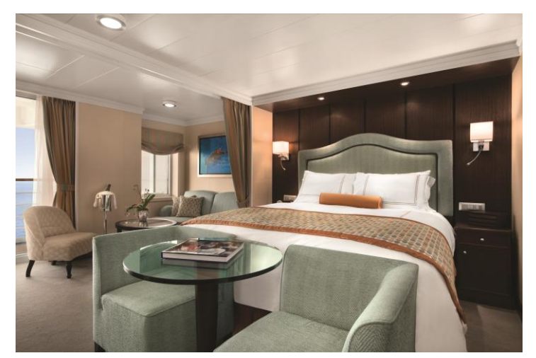
Penthouse Suite from $5,748 Square footage: Approx. 420 sq ft (including balcony) Category PH3 to PH1

Amenities: Private balcony, living area, dining area, queen-sized bed convertible to two twins; walk-in closet; large marble and granite-clad bathroom with full-size bathtub and separate shower, LCD flat-screen television, laptop computer with wireless access, welcome bottle of champagne, refrigerated mini-bar replenished daily, lighted vanity, thick cotton robes and slippers, cashmere lap blanket, hair dryer, safe, direct dial satellite phone and cellular service