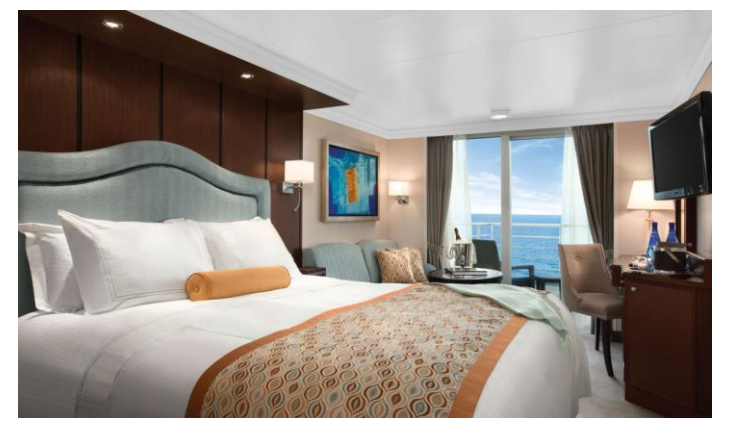
Veranda Stateroom from $4,148 Square footage: Approx. 282 sq ft (including balcony) Category B4 to B1

Amenities: Floor-to-ceiling panoramic windows, spacious seating area, queen-sized bed convertible to two twins; over-sized marble and granite bathroom with tub and separate shower, LCD flat-screen television, vanity desk, breakfast table, hair dryer, safe, thick cotton robes and slippers, refrigerated mini-bar, direct dial satellite phone and cellular service