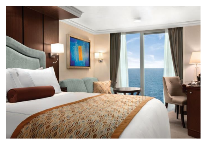
Deluxe Ocean View from $3,498 Square footage: Approx. 242 sq ft Category C

Amenities: Queen-sized bed convertible to two twins; over-sized marble and granite bathroom with shower, LCD flat-screen television, vanity desk, breakfast table, hair dryer, safe, thick cotton robes and slippers, refrigerated mini-bar, direct dial satellite phone and cellular service