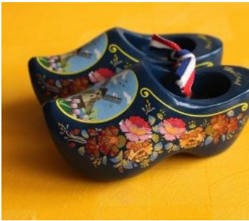
$ $ $ 1/2 Day Traditional Dutch Clog Painting (3 hrs) - Private