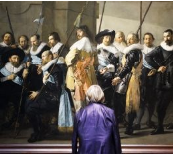
$ $ $ 1/2 Day Van Gogh Museum & Rijksmuseum (4 hrs) - Private Tour