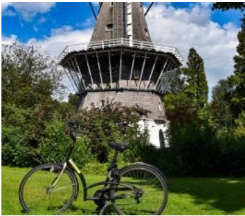
$ $ $ 1/2 Day Cycling Through Windmills (4 hrs) - Private Tour