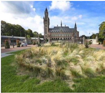
$ $ $ Rotterdam, Delft & The Hague (9 hrs) - Private Tour