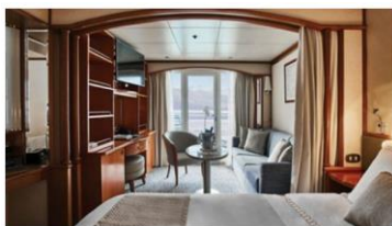
Classic Veranda Suite