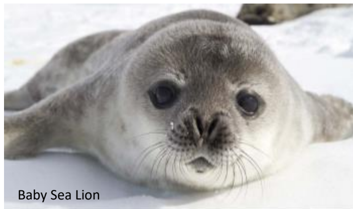
Baby Sea Lion