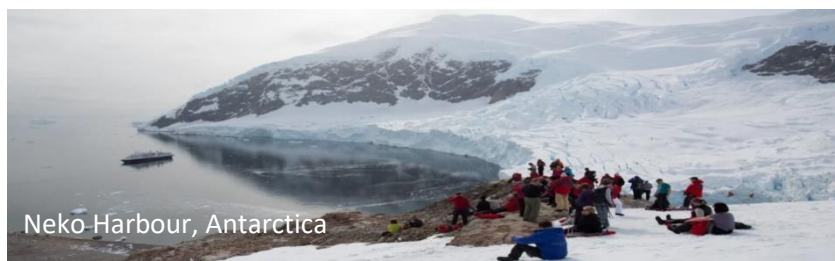
Neko Harbour, Antarctica

877-651-7447 or NorthBay@expediacruz.com