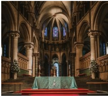
$ $ $ Leeds Castle & Canterbury (9 hrs) - Vehicle/Guide/Driver