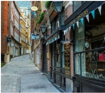
$ $ $ 1/2 Day Royal Warrant Walking Tour (3 hrs) - Guide