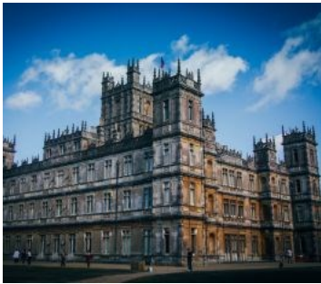
$ $ $ Downton Abbey (9 hrs) - Vehicle/Driver-Guide