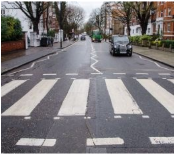
$ $ $ 1/2 Day Black Cab Beatles Tour (3 hrs) - Vehicle/Driver