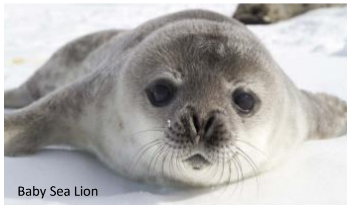
Baby Sea Lion