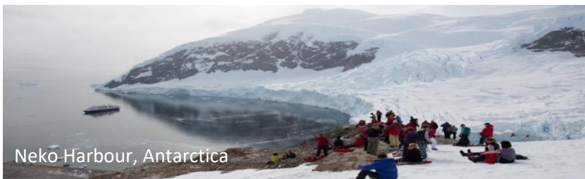
Neko Harbour, Antarctica

877-651-7447 or NorthBay@expediacruz.com