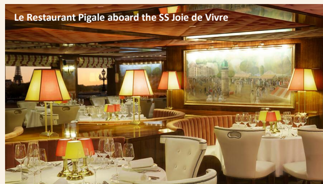
Le Restaurant Pigale aboard the SS Joie de Vivre