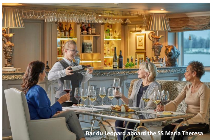
Bar du Leopard aboard the SS Maria Theresa