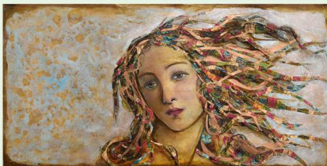
Thoughts Take Flight