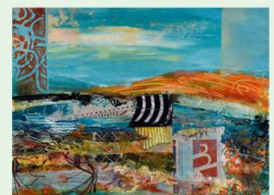
Traces of Tuscany.