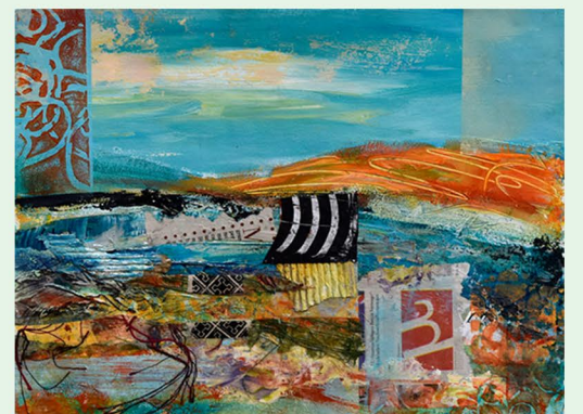
Traces of Tuscany.