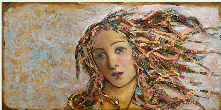
Thoughts Take Flight