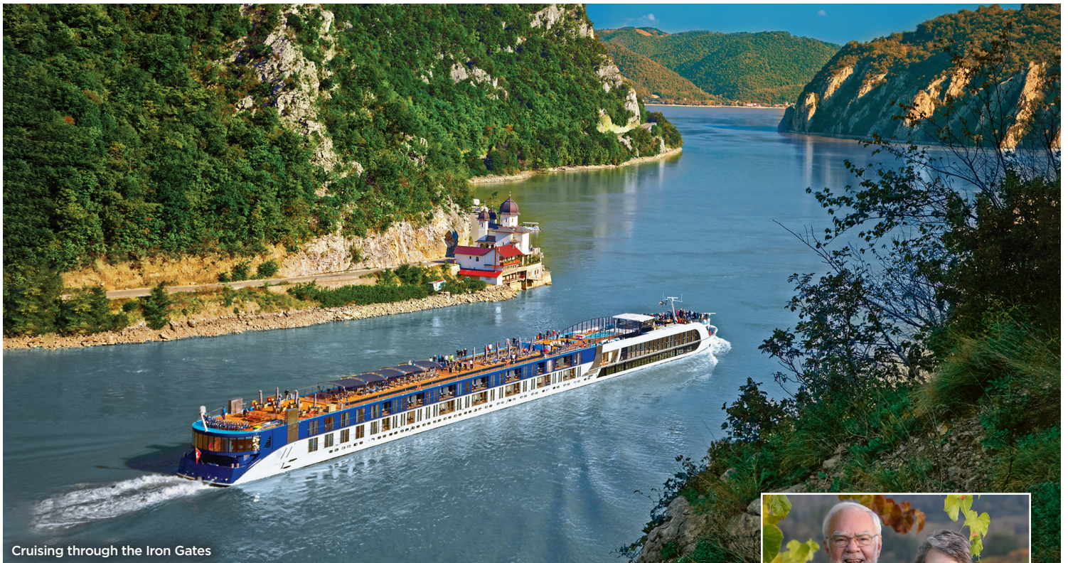
Cruising through the Iron Gates