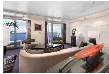
Oceania Suite Approx. 1,000 ft 2 (incl balcony) from $9,198