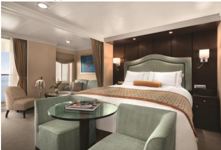
Penthouse Suite Approx. 420 ft 2 (incl balcony) from $5,598