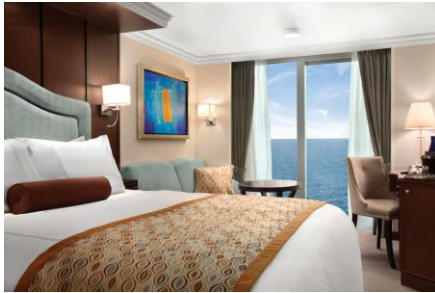
Deluxe Ocean View Approx. 242 ft 2 from $3,548