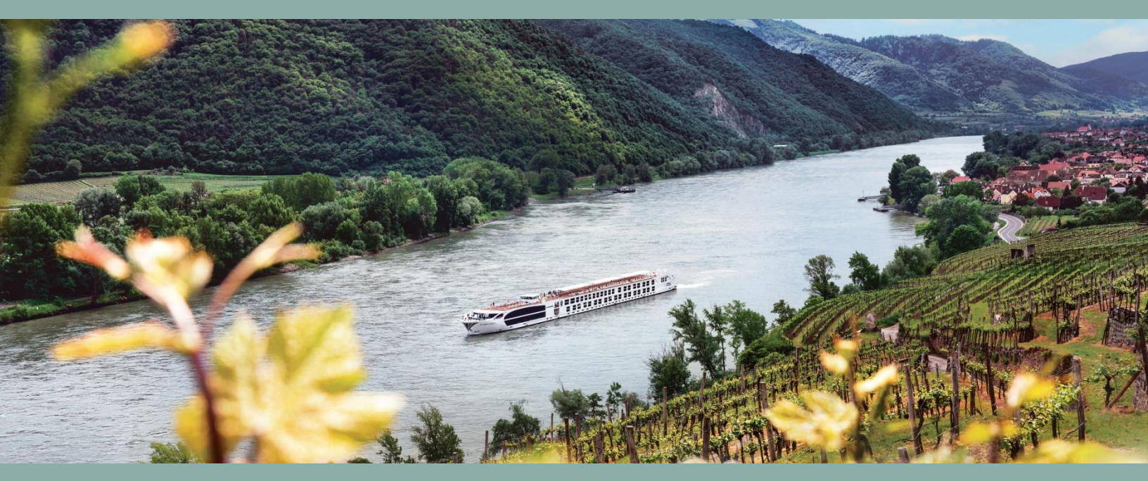
SS Maria Theresa, 7 Nights, Passau to Budapest, April 23-30, 2023

WITH BARREL OAK, MOLON LAVE, PHILIP CARTER, AND RAPPAHANNOCK CELLARS