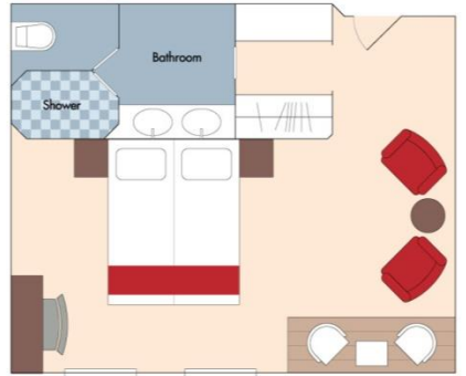
Floor-to-Ceiling Windows Outside Balcony