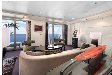
Oceania Suite Approx. 1,000 ft 2 (incl balcony) from $10,198