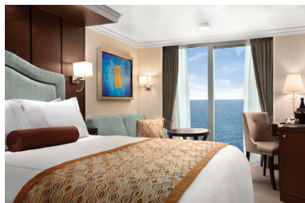
Deluxe Ocean View Approx. 242 ft 2 from $4,448