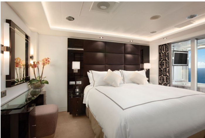
Oceania Suite $10,198 Square footage: Approx. 1,000 sq ft (including balcony)

Extras: Complimentary 24-hour Butler service, exclusive access to Executive Lounge staffed by a Concierge, priority check-in and early embarkation, priority luggage delivery, priority restaurant reservations