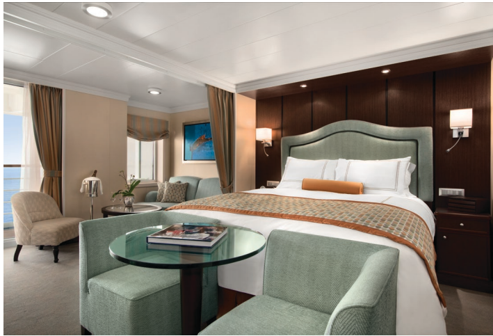
Penthouse Suite from $6,498 Square footage: Approx. 420 sq ft (incl balcony) Category PH3 to PH1

Amenities: Private balcony, living area, dining area, queen-sized bed convertible to two twins; walk-in closet; large marble and granite-clad bathroom with full-size bathtub and separate shower, LCD flat-screen television, laptop computer with wireless access, welcome bottle of champagne, refrigerated mini-bar replenished daily, lighted vanity, thick cotton robes and slippers, cashmere lap blanket, hair dryer, safe, direct dial satellite phone and cellular service