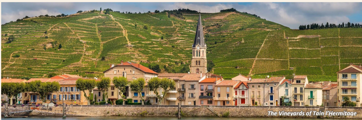
The Vineyards of Tain l'Hermitage

This Cruise Will Sell Out Quickly – Book Today!