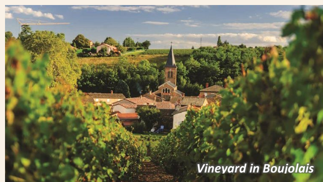
Vineyard in Boujols