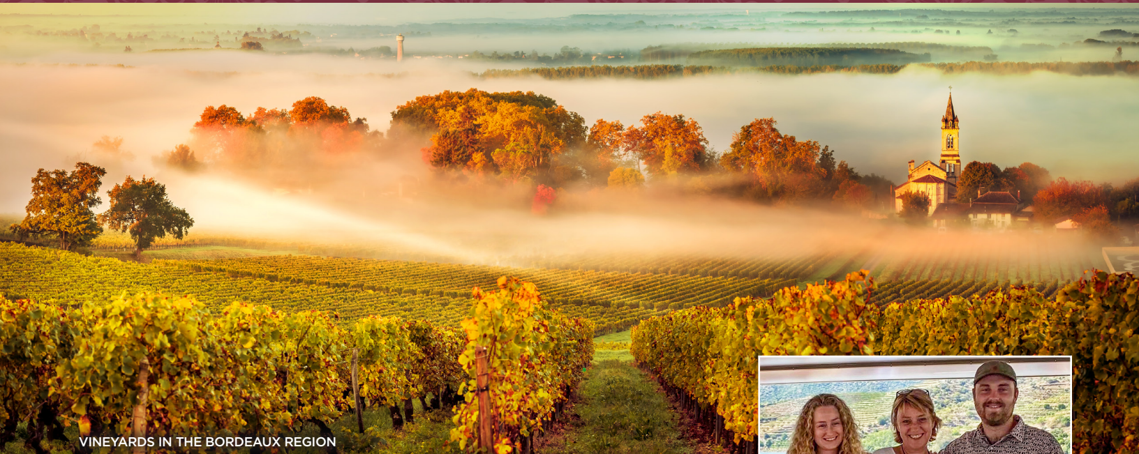
VINEYARDS IN THE BORDEAUX REGION

Uncork local traditions, savor intense flavors and enjoy palate-pleasing adventures during an AmaWaterways Wine Cruise