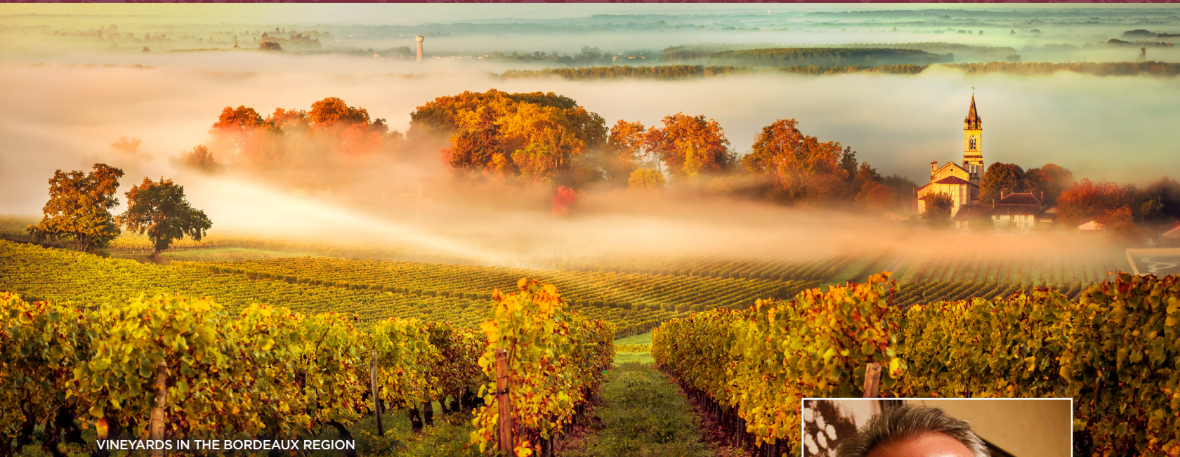
VINEYARDS IN THE BORDEAUX REGION

Uncork local traditions, savor intense flavors and enjoy palate-pleasing adventures during an AmaWaterways Wine Cruise