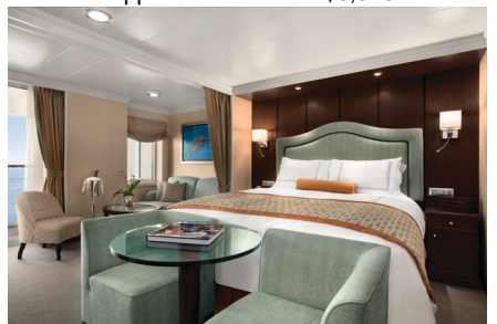
Penthouse Suite Approx. 420 ft<sup>2</sup> (incl balcony) from $5,598