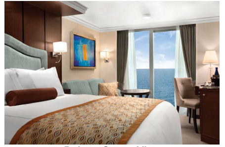
Deluxe Ocean View Approx. 242 ft<sup>2</sup> from $3,548

Oceania Cruises' beautiful 1,250 passenger Riviera will be your home. As we indulge in European culture, we will experience wine tastings, wine parties, and exclusive wine dinners. Learn about this renowned Dry Creek Valley winery, as we share great wines, stories, and experience the grandeur of Europe.