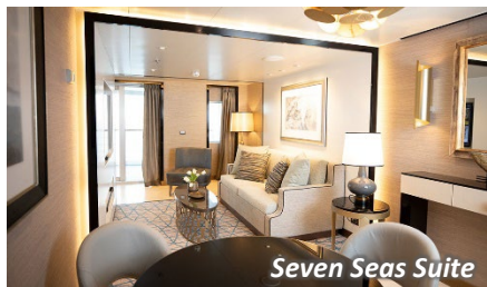
Seven Seas Suite