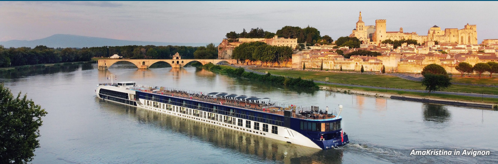
AmaKristina in Avignon

7 NIGHTS • JUNE 6 TO 13, 2024 Lyon to Arles – Aboard AmaKristina